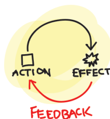
Figure 4: Effective Feedback Loop

A critical best practice is to follow up on the input stakeholders provide throughout the Annual School Planning Process, which includes data analysis, needs assessment, root cause analysis, developing the ESSA LEA plan and school plans, and progress monitoring. Stakeholders should be aware of feedback loops (see Figure 4), meaning how/when input is incorporated and the outcome. Mechanisms should exist for parents to provide regular, ongoing feedback. Education decision-makers need to show they are continuously listening when stakeholders share their thoughts.